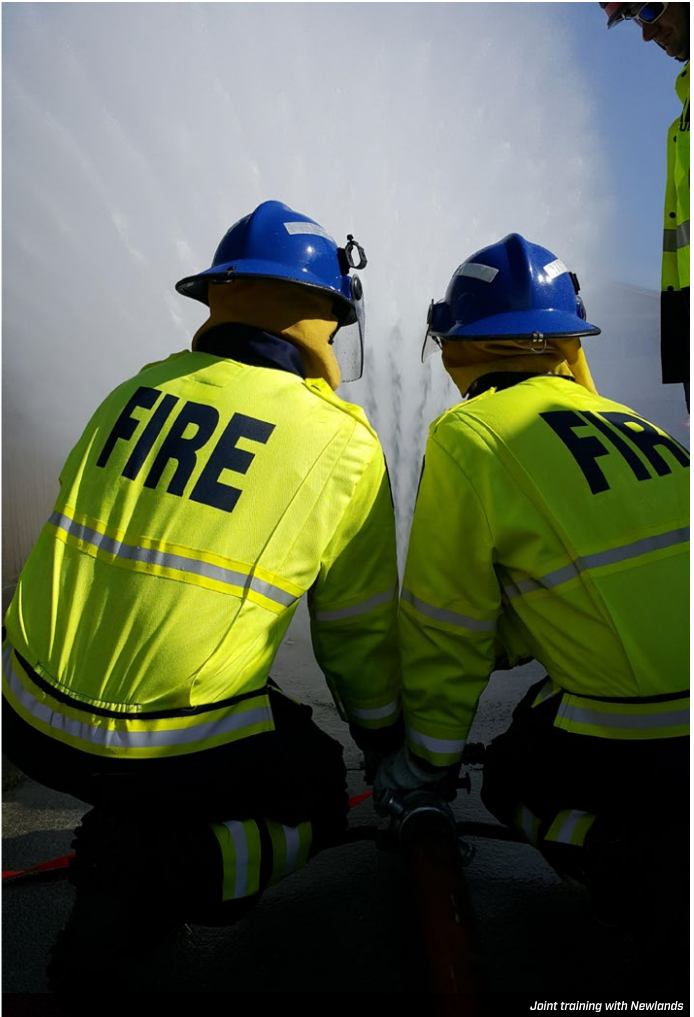
Joint training with Newlands