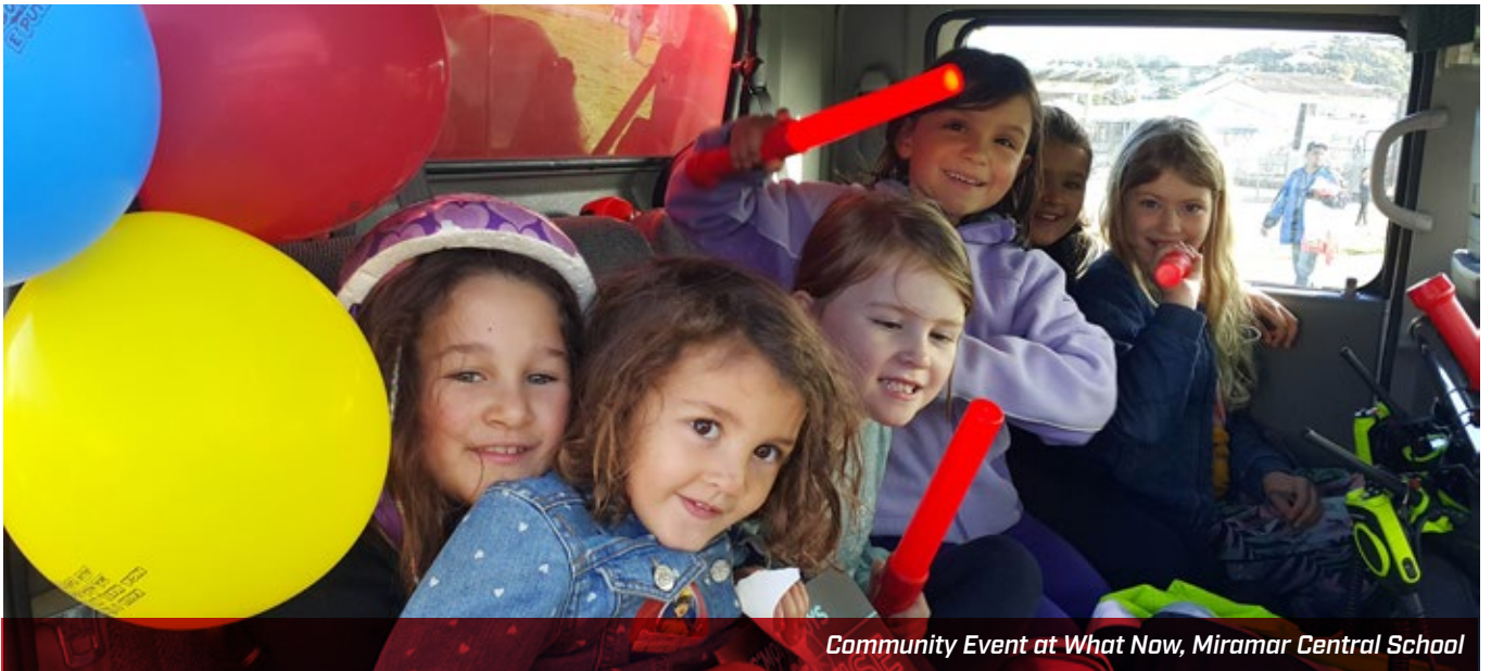
Community Event at What Now, Miramar Central School