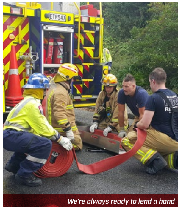
We're always ready to lend a hand