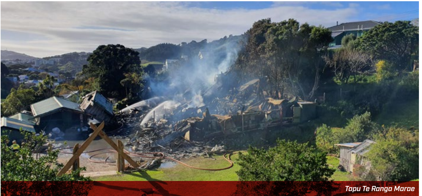
Tapu Te Ranga Marae