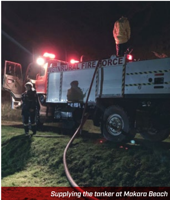
Supplying the tanker at Makara Beach

This was a great example of rural and urban teams working well together, utilising our skills and resources.