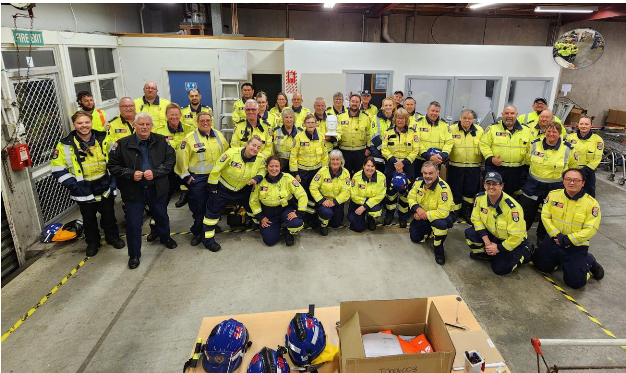
Joint Operational Support Training: WOSU Members amongst others at a joint training event in Petone.