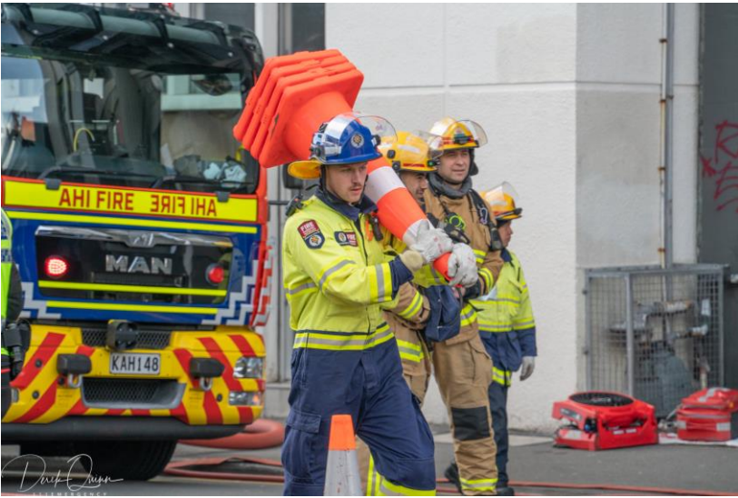
17 September 2022: Members attended a second-alarm incident on a busy Cambridge Terrace (near Courtenay Place) for several hours on a Saturday afternoon.

In order to minimize traffic disruption, it was preferred to keep Cambridge Terrace open to traffic, so our crew were kept busy looking after an open traffic lane within the cordon area.