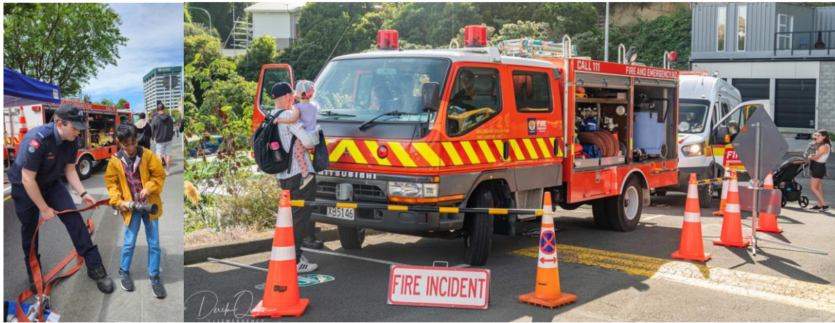
Events: QFF Duncan Tabor engages with the public at A Very Welly Christmas 2022; KILB2426 on display at the Newlands Fire Station Open Day (March '23).