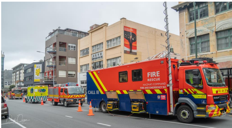
Incident Response: Our appliance Kilbirnie 2426 seen stationed next to the Command Unit Wellington 2118 at a 3 rd Alarm fire on Ghuznee St, October 2023.