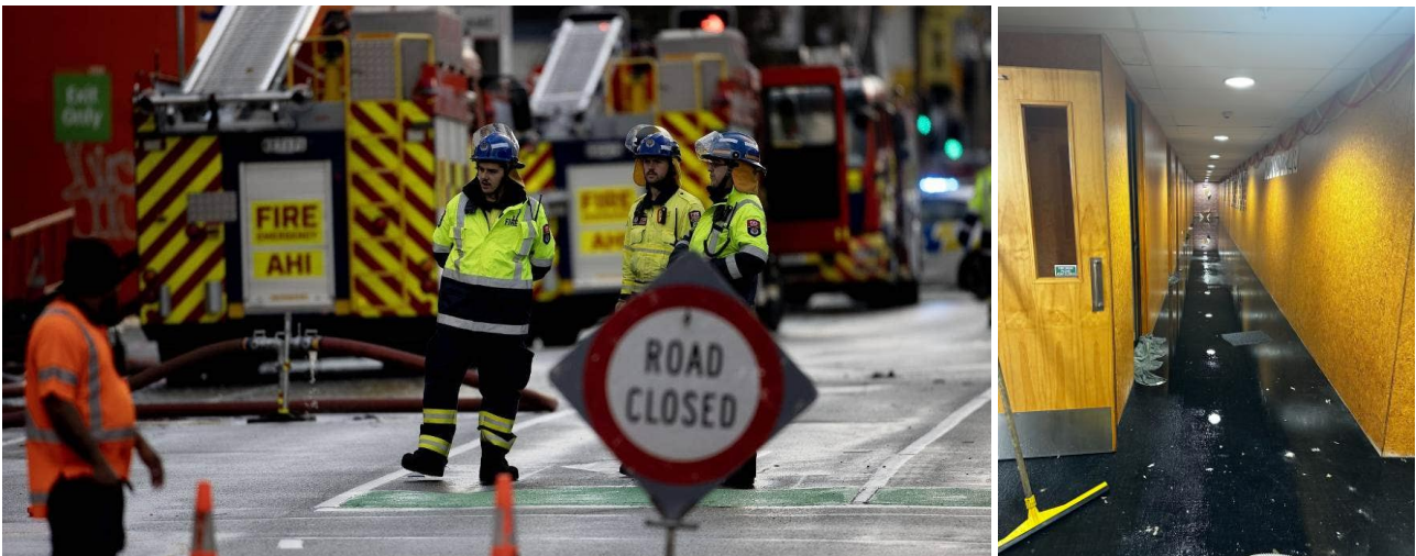
Below Right: A major salvage incident in Kelburn, March 2024